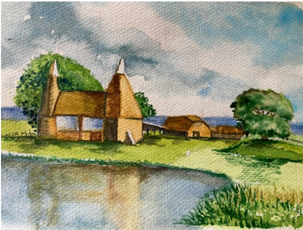
Sybil Critchley - Landscape water colour - Tuesday Art

The dates for Cinema in Caryford have also been corrected in this issue Good Wishes for 2024