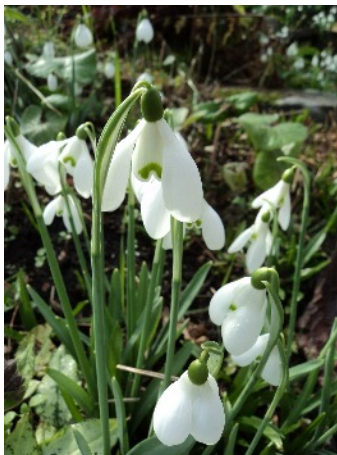
Snow drops: Anne Wood