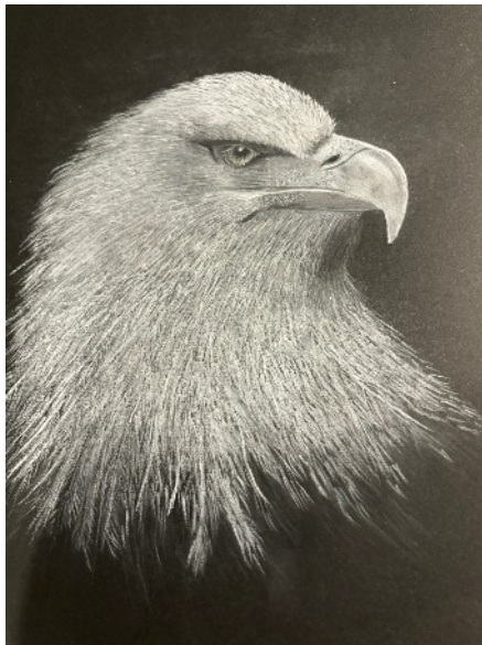
Dayella Stickland – Pastel – Tuesday Art