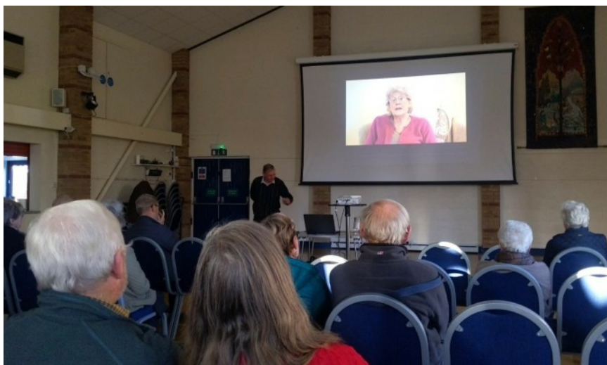
The audience listening to the reminiscences of a Christmas Party given for local school children

For those who are interested there is lots of information on the Southwest Airfields Heritage Trust website. They also they have heritage centres at Dunkeswell and Smeatharpe, which are open to the public from Easter until the end of October.