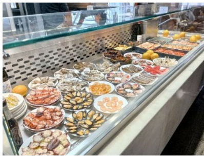
Left: Fruits de mere.